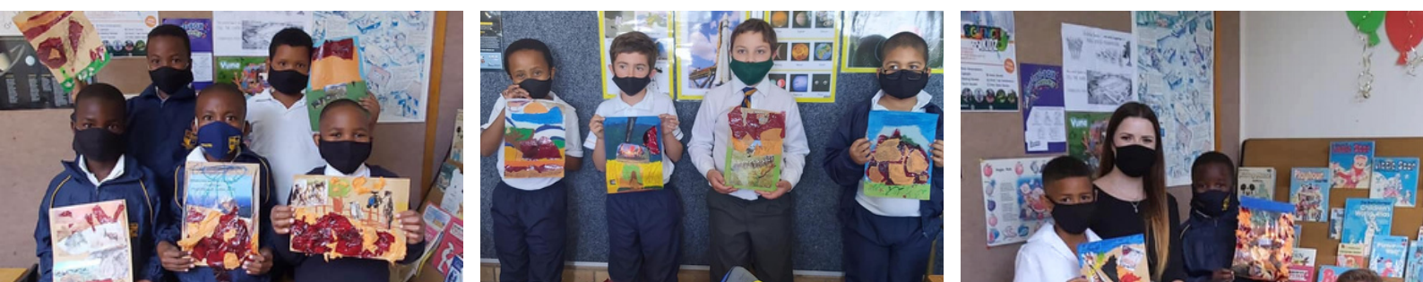
Afrikaans comes alive in Grade 3! Below pictures of the boys listening, speaking and reading the story of Little Red Hen.