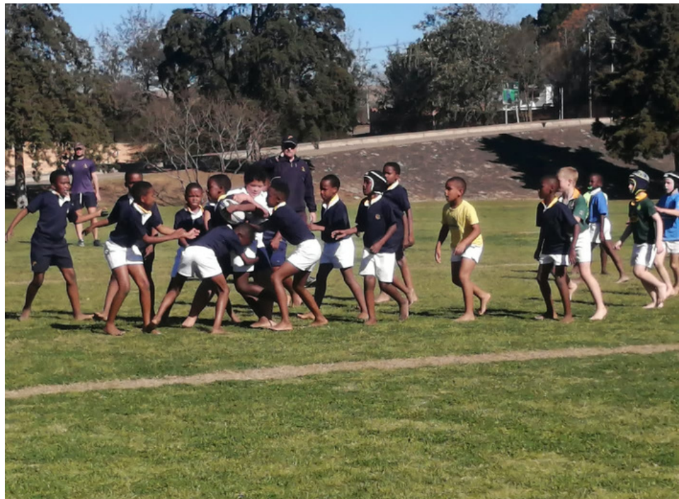
Below: Pictures of the junior rugby this week.