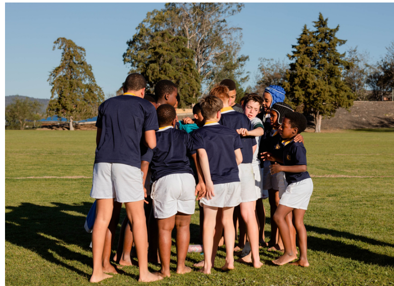
Below: Pictures of the U11 B side who: won 10/7