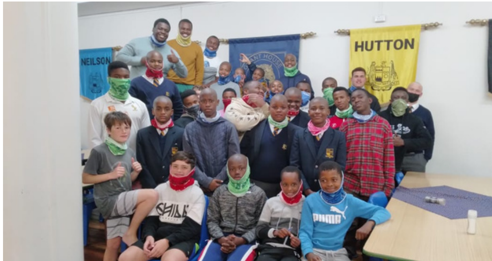
Left top: The Grant House boys sporting their colourful topes this week.

Additionally, we would love you and your family to take a photo wearing the topes, with your son in their school uniform. We would love to add these to the newsletter every week. Below are the photos we have received this week.