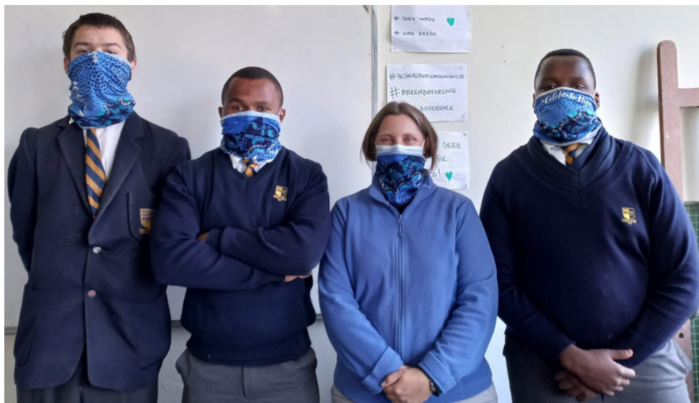
Left below: The Grade 10 Maths class also showing their support!