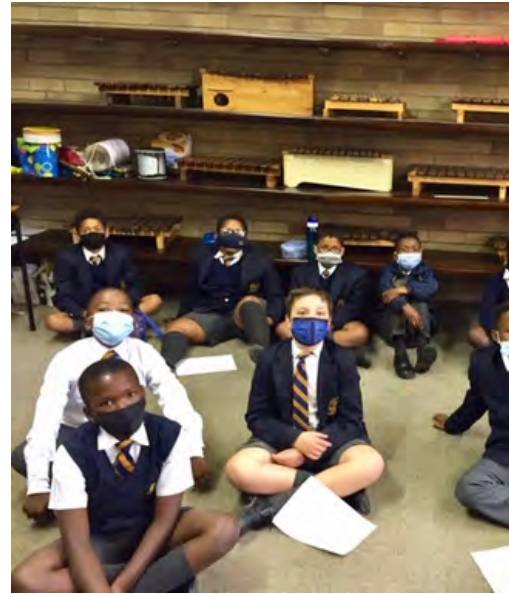
Above: The Grade 4s enjoying music class this week. Below: The Grade 2s doing the cha cha slide dance.