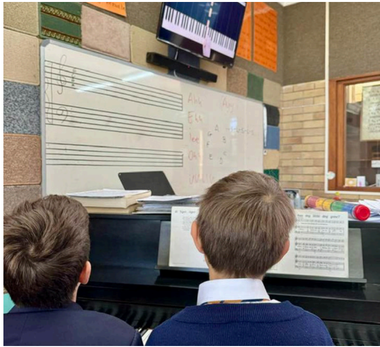
Above right: Young pianists ardently learning and practising an arrangement of a very exciting piece of music. Watch this space!

Tuesday: 13h30 - 14h15 Junior Choir Wednesday: 13h30 - 14h30 Senior Choir Thursday: 13h30 - 14h30 Senior Choir