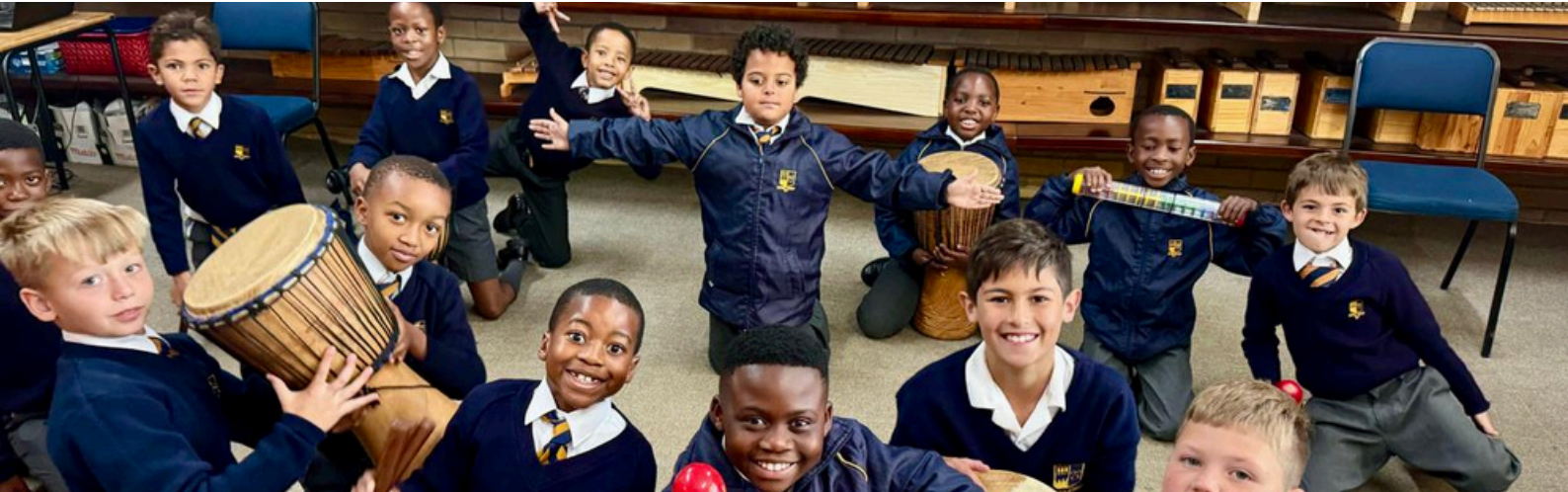
Below: The Grade 3 class had lots of fun learning about rhythmical layering! The boys had the opportunity to perform and sing a favourite song in small percussion groups for their class.