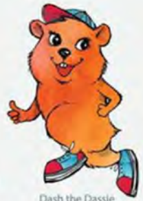
Dash the Dassie